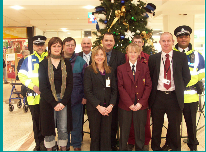
Picture above shows representatives from Kingdom Shopping Centre, Events & Media Solutions Team

This is a new scheme to help ensure the Kingdom Shopping Centre meets the needs of customers with learning disabilities. The centres cleaning and security staff, have undergone disability awareness training provided to them by Fife Employability Team. These trained staff members now wear badges to identify them as members of the 'Support Zone'. This now allows customers to know that they can be confident in approaching them and that they will be treated with consideration and respect no matter what help they require.