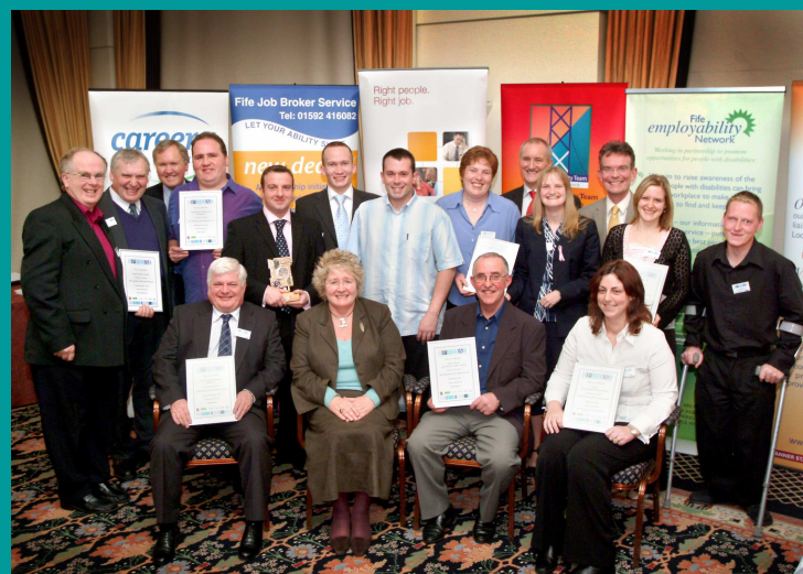
Picture shows the winners of FBDA 2005 with Anne McGuire, Minister for Disabled People.

It couldn't be easier – nominations will be accepted from employers, a member of staff or a customer. If you feel a business is a potential Award Winner you can download the form on www.fifedirect.org.uk/fenlink or call